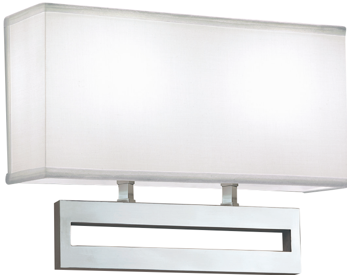
Broadway1 Double Sconce BR01-BA-CS